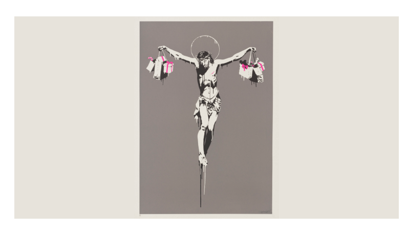
Christ with Shopping Bags. Image by Banksy.